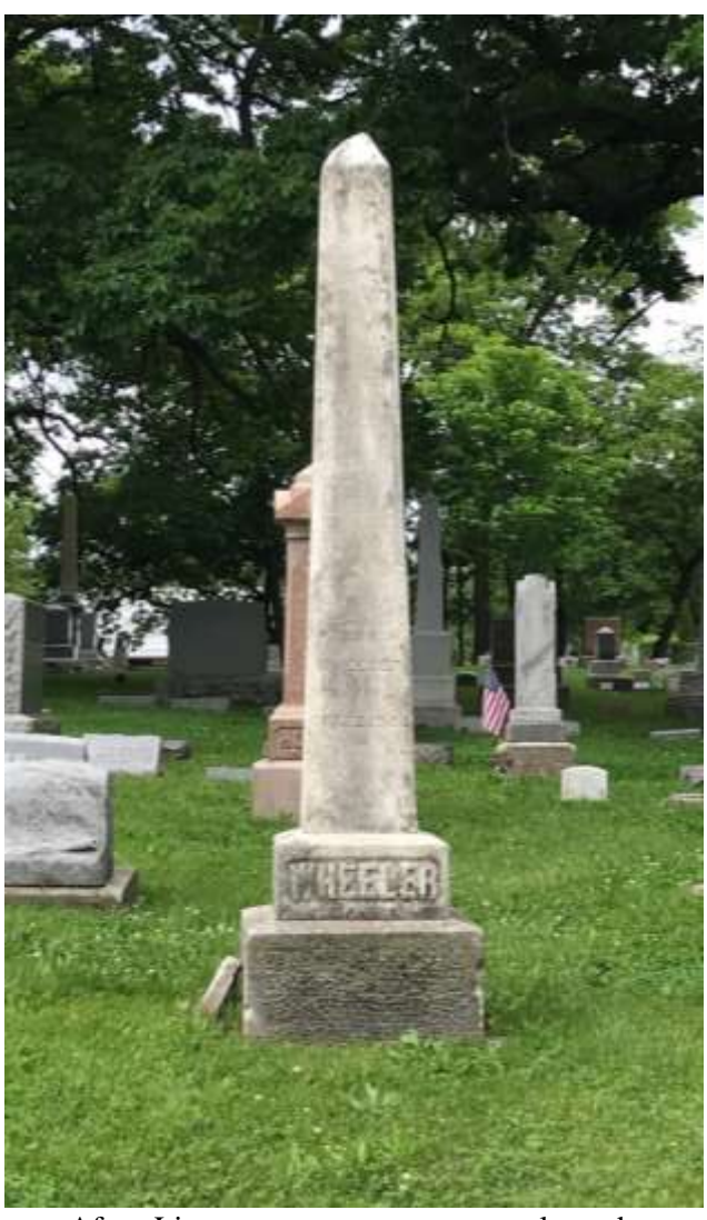
After: Limestone monument reset, cleaned