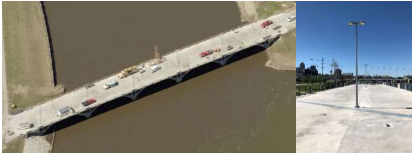
Oblique Aerial Image of Bridge Rehabilitation (left) - Rehabilitated Bridge Deck Condition (right)