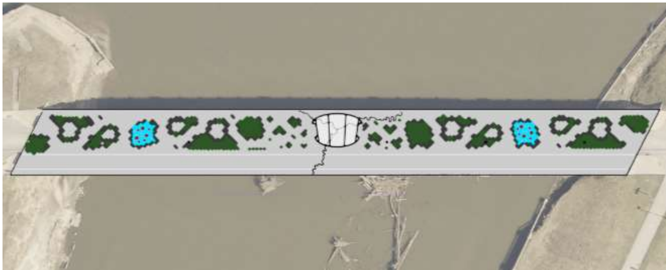
SW 1 st Street Bridge Improvements - Concept Plan