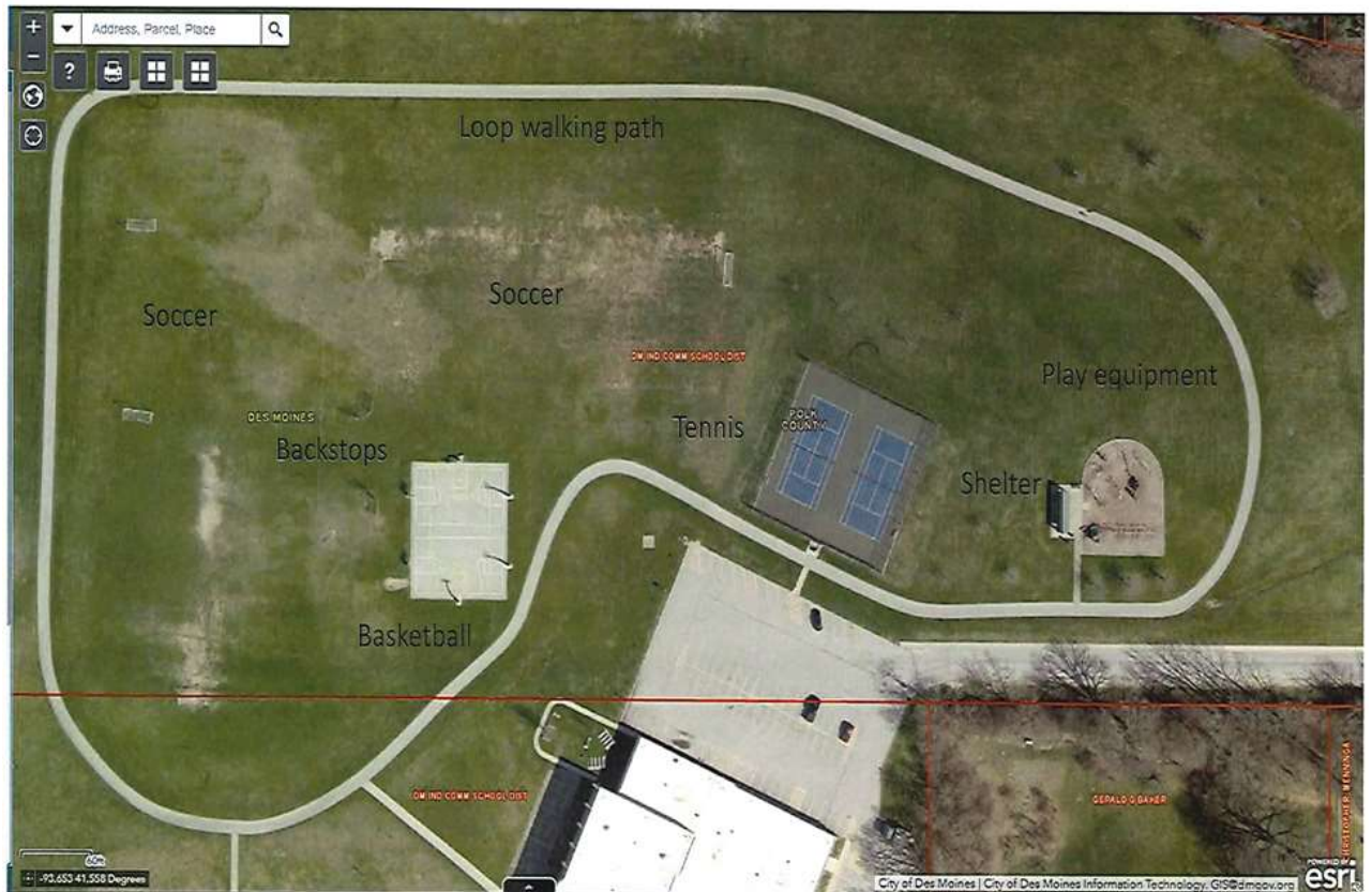
Brody School Park Exhibit A