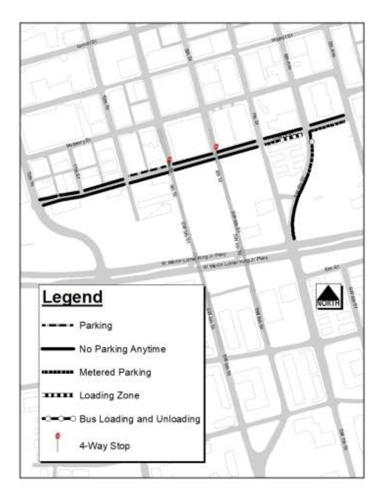
Sec. 114-2658. Southwest Sixth Street--Cherry Street to Army Post Road.

B. The revisions will allow the installation of three (3) additional metered parking spaces on the east side of SW 6<sup>th</sup> Street south Cherry Street. It also corrects the measurement of the parking restrictions on the east side of SW 6<sup>th</sup> Street from a point south of Cherry Street to West Martin Luther King Jr Parkway.