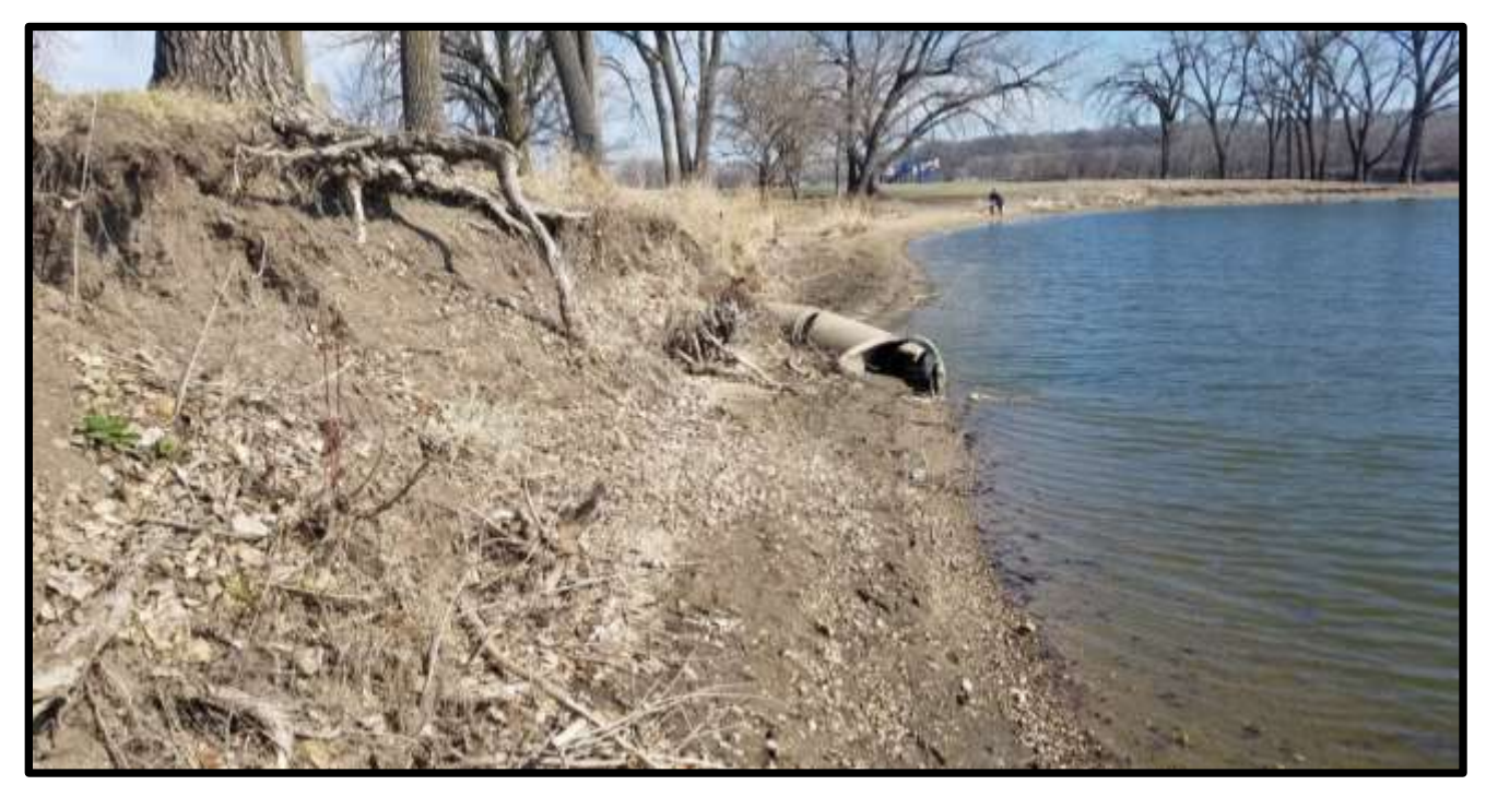
Photo above: North-centrally located 6-foot tall eroded lake shoreline and damaged storm sewer.