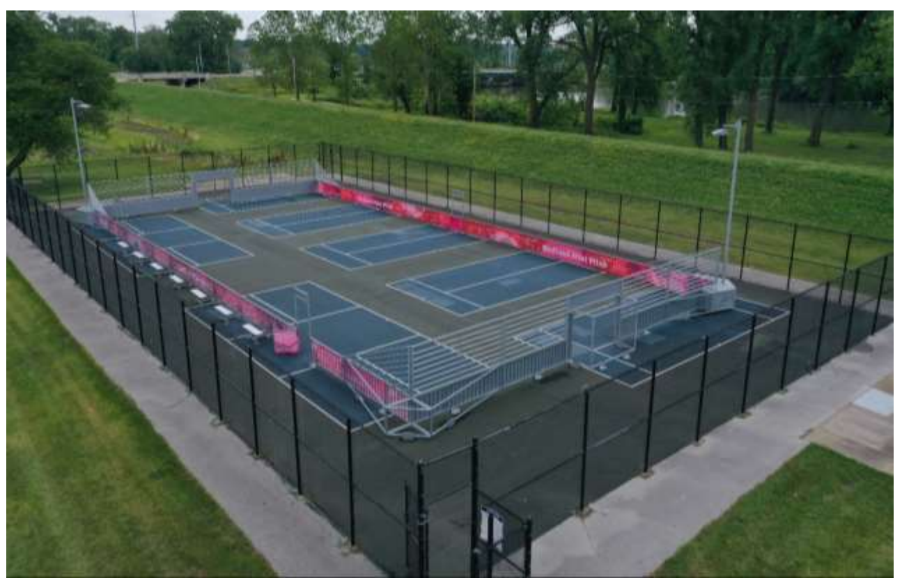
Example of the Mini-Pitch System installed at Birdland Sports Complex.