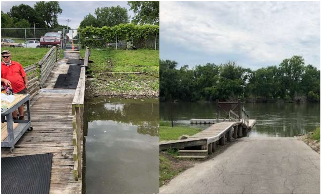
Degraded Streambank and Makeshift Ramp at Captain Roy's