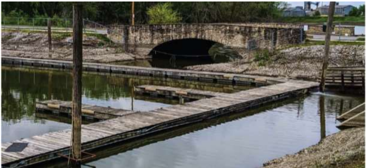
Marina Access Ramps Poor Condition