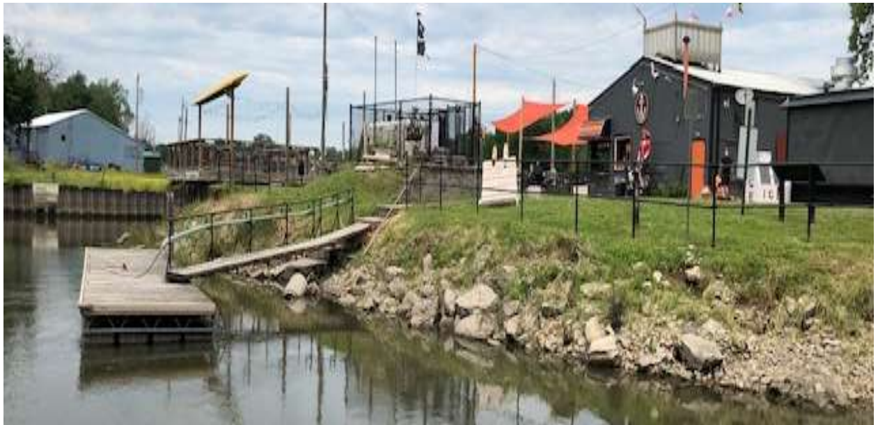
Degraded Landscape And Des Moines Rowing Club Access Ramp